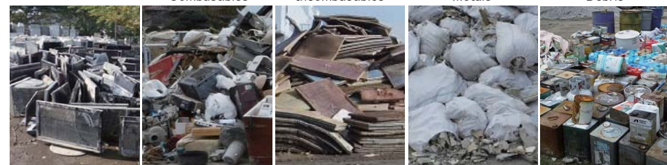
4 household appliances Small appliances Tatami, Mattresses Gypsum board, Slate Hazardous Materials

We apologize for any inconvenience caused in a disaster, but we appreciate your understanding and cooperation to dispose disaster waste as soon as possible.