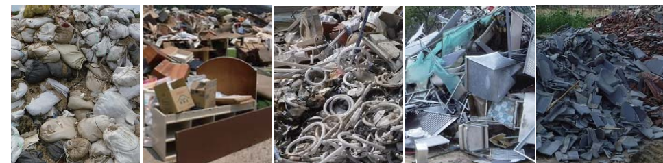
Debris mixed with earth and sand Combustibles Incombustibles Metals Debris